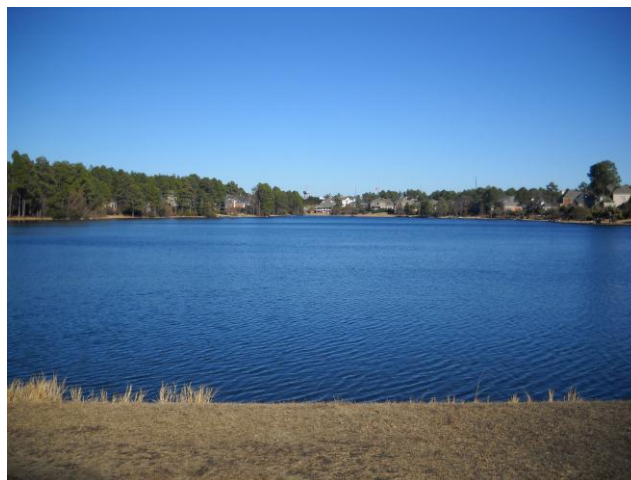
Hughes Pond, Gills Creek headwaters

Until 2010, The South Carolina Department of Health and Environmental Control (SCDHEC) collected samples at four water quality monitoring stations within the watershed. Two were located on Gills Creek (C-017 and C-001), one on Forest Lake (C-068), and one on Windsor Lake (C-048). Three of the four stations have exceeded various SCDHEC numeric criteria resulting in those waterbodies being listed as impaired and placed on the State's 2010 303(d) list. Both sites located on Gills Creek are impaired for recreational uses due to an exceedance of fecal coliform concentrations. At the down-stream Gills Creek site (C-017) aquatic life uses are also not supported as a result of low dissolved oxygen (DO) levels. Forest Lake (C-068) is impaired for fish consumption caused by high mercury levels (SCDHEC, 2010). Since 2010, SCDHEC has reduced the amount of sampling sites to only include the site furthest downstream, C-001.