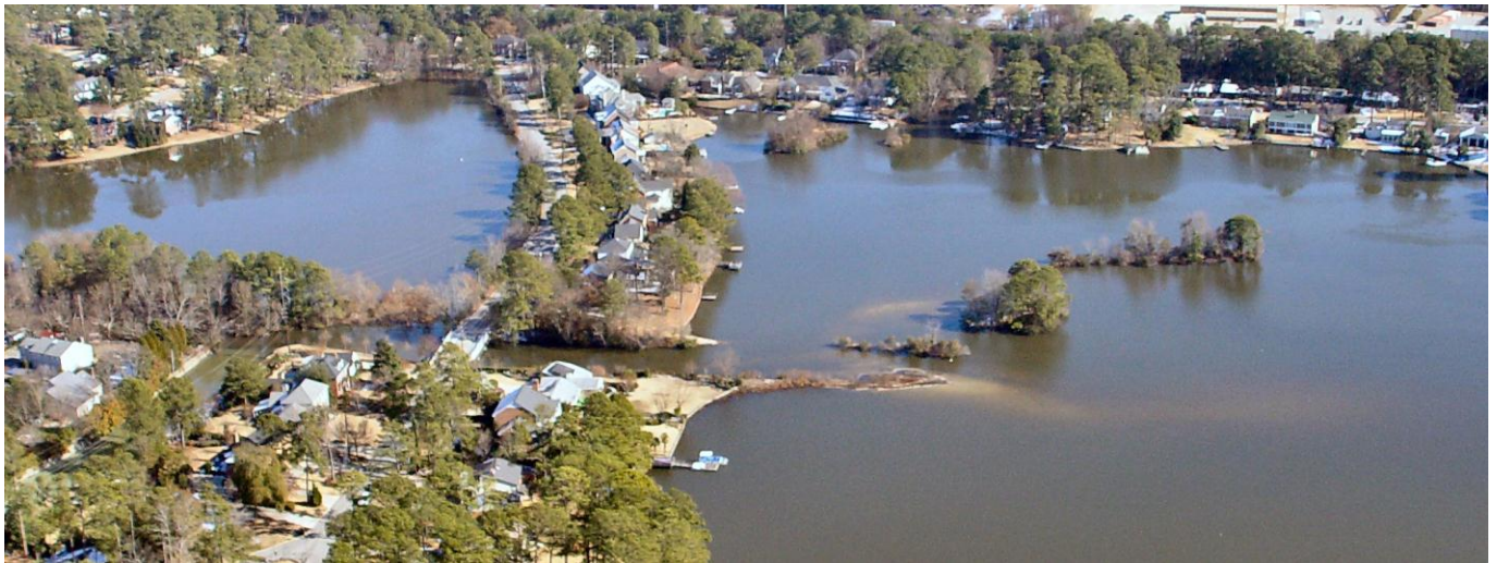
Big and Little Lake Katharine