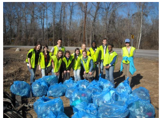
Clean up on S. Beltline