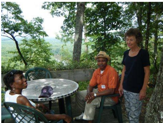
Guests and host of 1st Annual Wine for Water