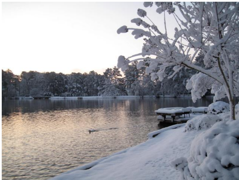
Snow day on Spring Lake