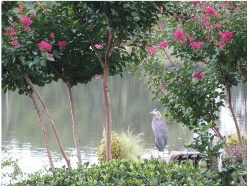
Blue Heron on Spring Lake

Goal #7: Develop GCWA Board of Directors to include a number of strong leaders and a membership that understands and fulfills its roles and responsibilities as Directors. Board of Directors Events and Activities