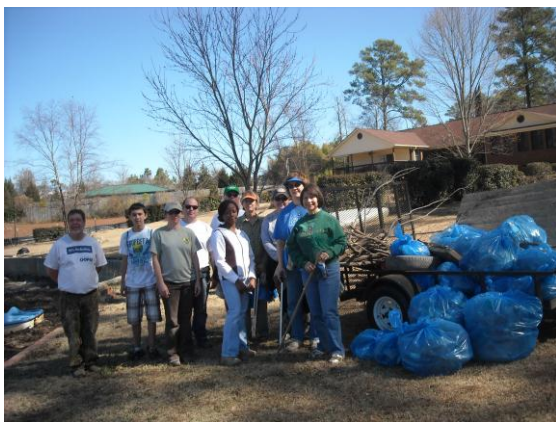
Clean up on Cary Lake