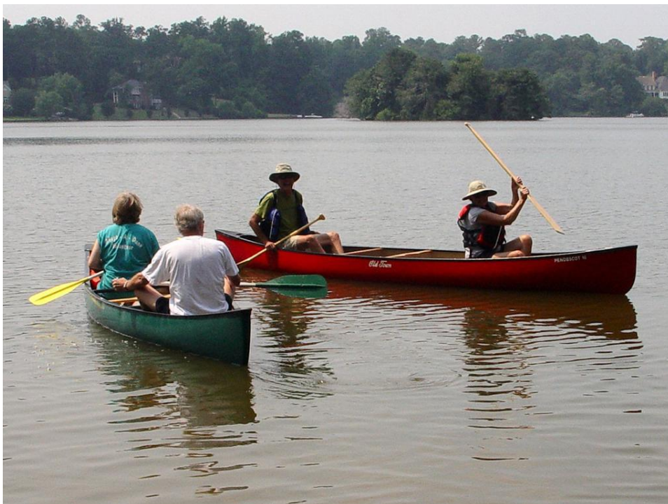
Participants canoeing in Lake Katharine

This event took place at the Lake Katharine boat ramp. Attendees were able to kayak or canoe on Lake Katharine. This was followed up with box lunch on the shoreline of Lake Katharine.