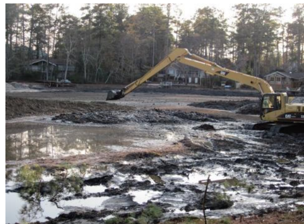
Removing sediment on Cary Lake