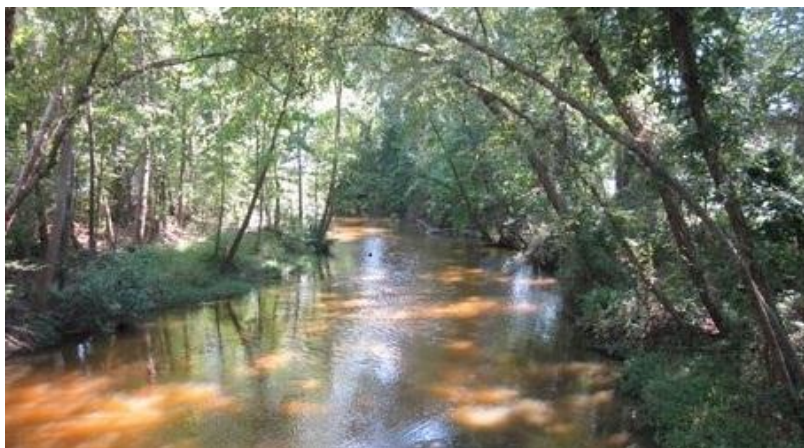
Gills Creek Behind Trenholm Plaza

The GCWA appreciates the hard work and dedication from our volunteers, board members, and staff in the many accomplishments of FY 10/11 and look forward to many more accomplishments in the years to come.