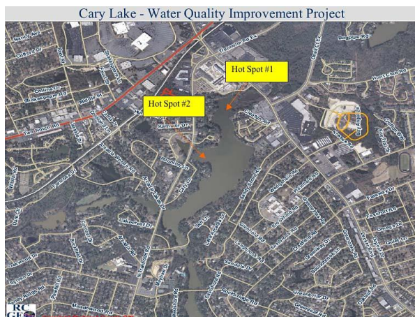
Cary Lake Project

With a donation from the Cary Lake Homeowner's Association, the GCWA was able to document the construction work that took place at Cary Lake. The purpose of this video is to serve as a promotional video to explain the role of the GCWA. This video can be found on our website.