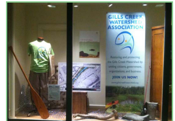
GCWA window display at Mast General Store