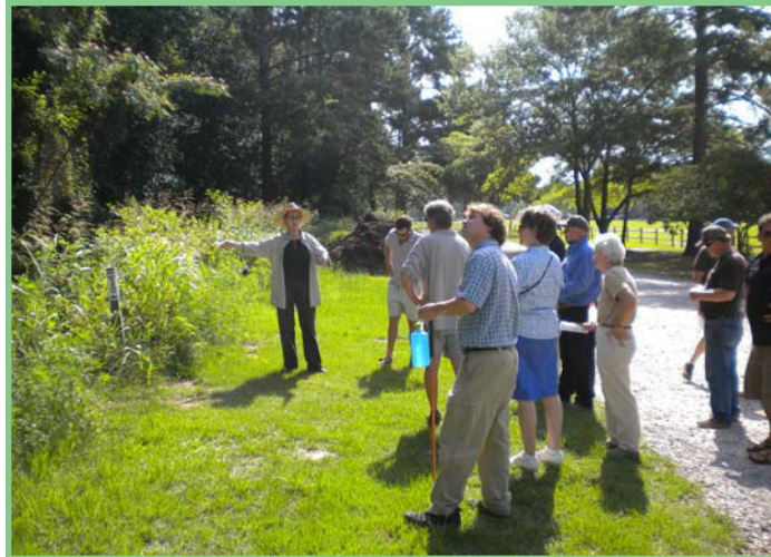
Touring the Owens Field Park improvement project

The GCWA was awarded a grant from the Richland County Conservation Commission to install three environmental education kiosks around the Gills Creek Watershed. These kiosks will educate the public on the impairments of Gills Creek Watershed and what they can do to help.