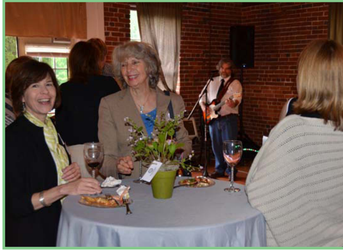
Wine For Water on Earthday with Rocky Branch Watershed Alliance and Smith Branch Watershed Alliance at Senate's End