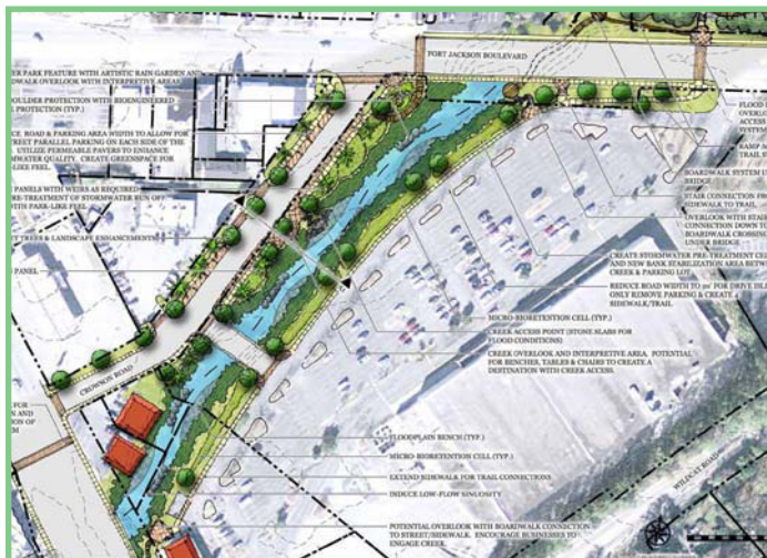
Middle Watershed project rendering of the Crowson Road area