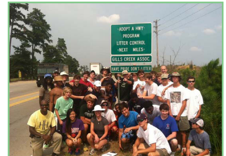
Adopt A Highway cleanup in cooperation with Heathwood Hall