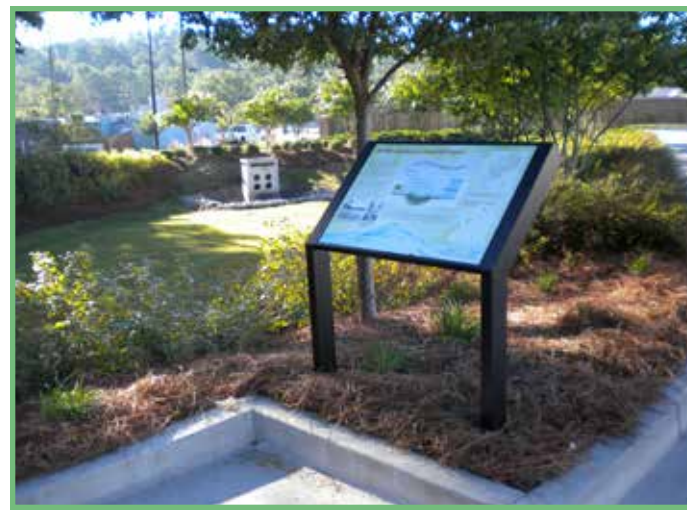
Cross Hill Market educational kiosk which describes the mechanism of rain gardens and retention structures in controlling stormwater run-off..