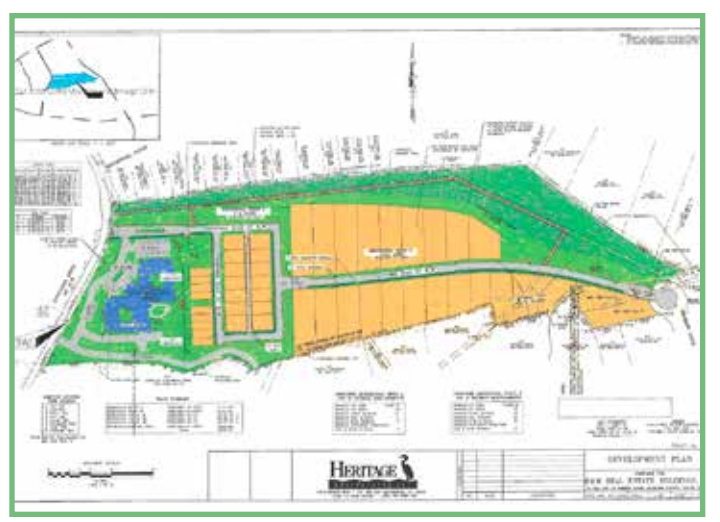
GCWA worked with Forest Acres and concerned residents to reduce the impact of a controversial Forest Acres development