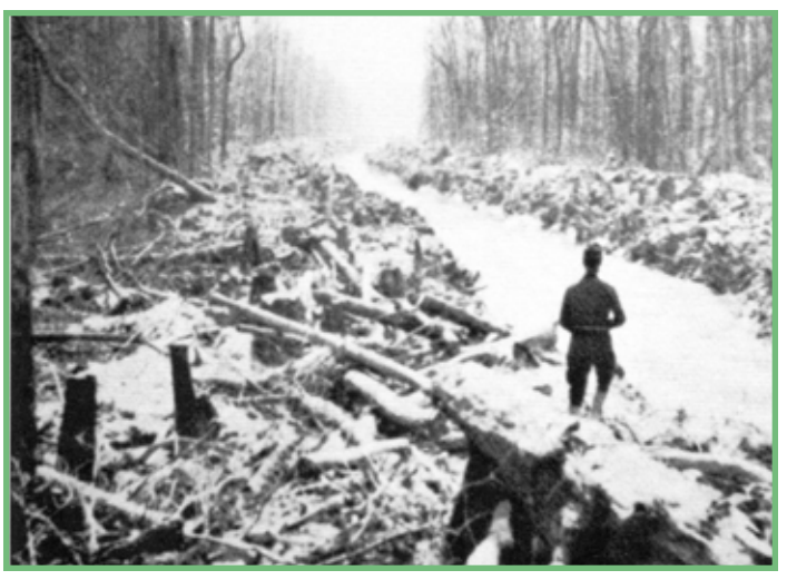
Photo (courtesy of Fort Jackson) featured in Warner Montgomery's book on Forest Acres which shows the channeling that occured when Camp Jackson was built was part of the library lecture series.