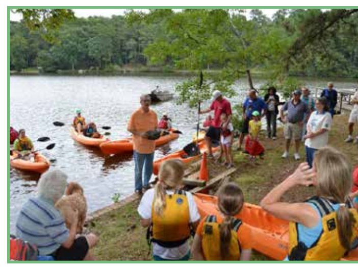
Urban Paddle on Cary Lake attracted a crowd of young and old for paddling and picnicking.