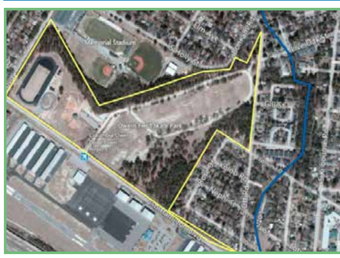
Owens Field Park BMP construction and education project will instal structures to reduce stormwater run-off and provide informational kiosks as part of the park's upgrade.