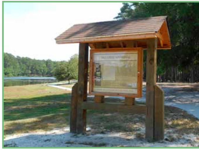
Educational kiosk at Sesquicentennial State Park explains the watershed concept to visitors.