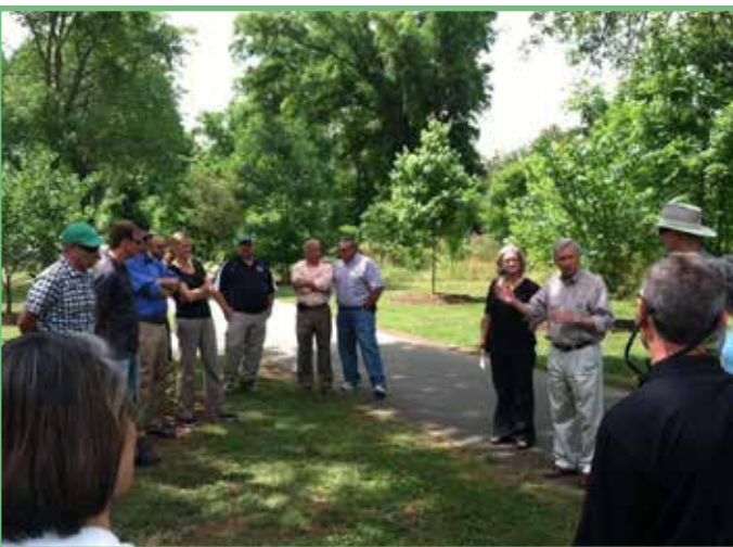
Little Sugar Creek Greenway fact-finding field trip with representatives of the city and county to understand Charlotte's process for stream restoration and building a greenway.