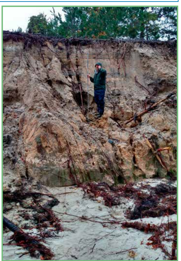
The "upditch" above Entrance Lake in Spring Valley showing the severe erosion that will be improved by the Little Jackson Creek Mitigation project.

Education Committee meetings are usually held the first Tuesday of every month Open to the public.