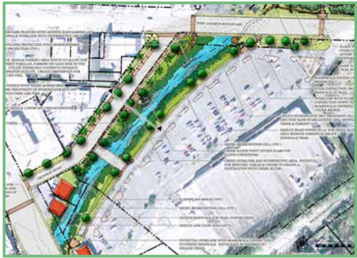
Middle Watershed project rendering of the Crowson Road area of a greenway which is being funded by the Richland County Transportation Penny Tax.