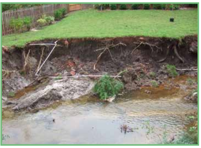
grant. The Forest Acres buffer ordinance will prevent this in future developments.

The GCWA, working in coordination with Richland County, applied for and was awarded a 319 nonpoint source pollution reduction grant from the South Carolina Department of Health and Environmental Control. Grant funds are being used to construct three bioretention cells at Owens Field Park that