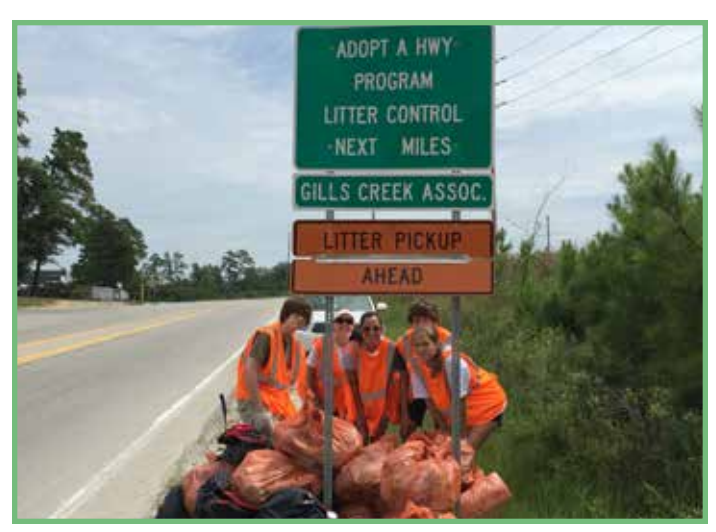
Adopt A Highway cleanups in cooperation with Heathwood Hall are conducted 4 times a year on South Beltline.