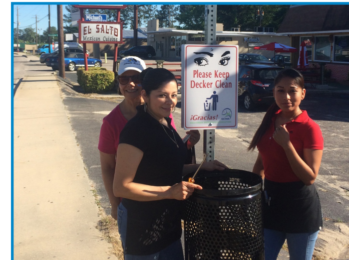
Bus stop litter containers on Decker Blvd