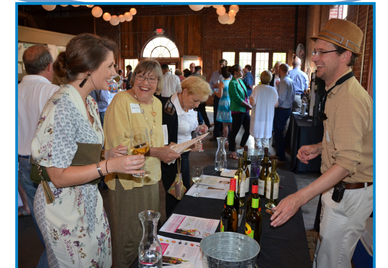
2016 Wine For Water Annual Fundraiser