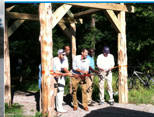
Owens Field Park Ribbon Cutting