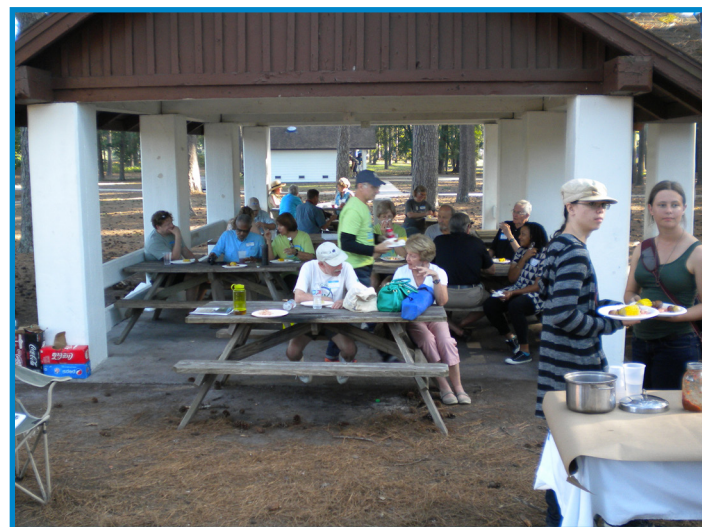
2016 Annual Meeting at Sesquicentennial State Park.