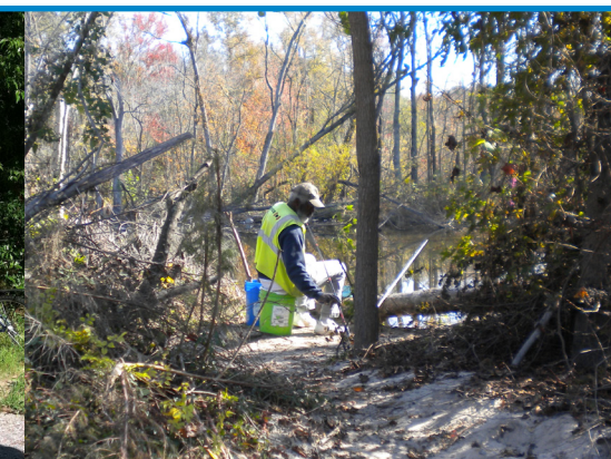
Fishermen interviews for the EPA Fish Tissue Study.