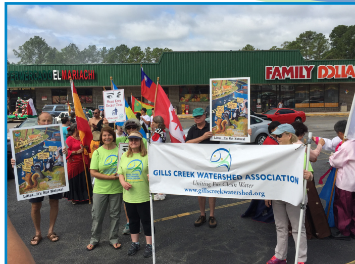
International Festival on Decker Boulevard