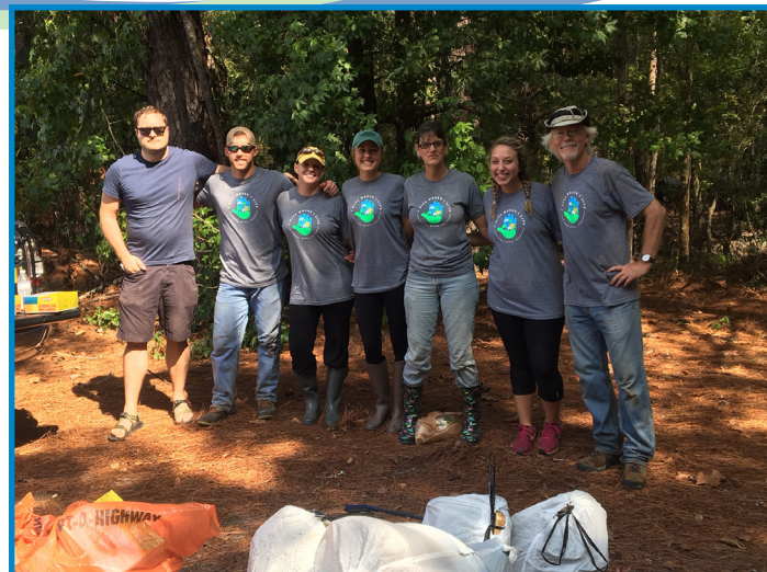
Litter pickup with folks from EDENS