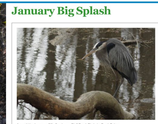
The Big Splash e-newsletter